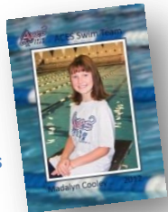
Trading Cards & Magnets