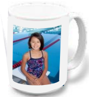
Keychains & Mugs

Choose from a variety of products, like mugs or key chains. A wall calendar makes a great gift for Mom or Dad's office and for grandparents, aunts and uncles. Get a refrigerator magnet to display all year!