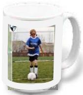
Keychains & Mugs

Choose from a variety of products, like mugs or key chains. A wall calendar makes a great gift for Mom or Dad's office and for grandparents, aunts and uncles. Get a refrigerator magnet to display all year!